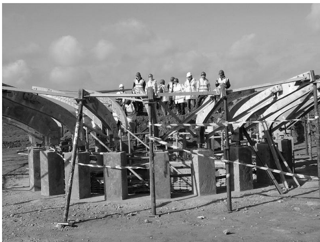
Figure 3: A photograph of the Naples Airport Underground Station project in progress: April 2008.

Another notable observation related to how certain roles were perceived to be more important than others. As part of the Constructionarium experience, students not only have to construct the structures, but also to manage both the costs and quality aspects of the construction process. However, it became clear very quickly that students became preoccupied in pushing for production delivery at the expense of maintaining up-to-date records of cost expenditure and quality control. During academic year 2006-2007, the contractor had assigned one of their trainee quantity surveyors to help police the work that students were doing for the Barcelona Tower Project. Although he was briefed to check on the cost management activities, it became obvious as with all the other teams that cost management played second fiddle to the need for completing the production of the building on time. Consequently, students consistently failed to account for the costs of their projects because they had concentrated their efforts on working hard on the manual aspects of the job. Still, the trainee quantity surveyor commented that he benefited from the experience by becoming more sympathetic towards the construction team in the future of his professional practice: "Whereas talking to subcontractors in the past, my whole conversation would be based around how much an issue is going to cost us. Now, I would be more sympathetic now, it would be what must we do to ensure that the project progresses."