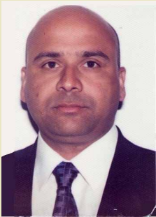
By: Khalid Bhutto Glasgow Caledonian